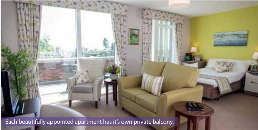
Each beautifully appointed apartment has its own private balcony.