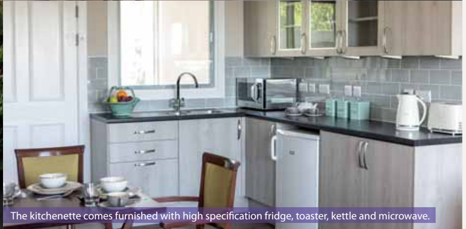
The kitchenette comes furnished with high specification fridge, toaster, kettle and microwave.