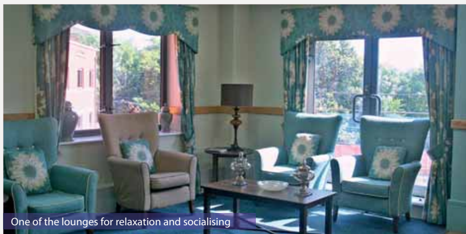
One of the lounges for relaxation and socialising